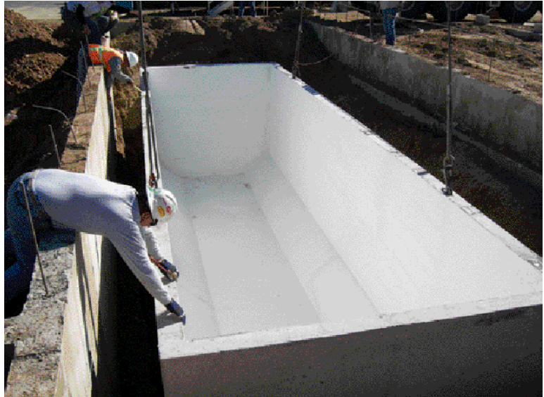
A 15,500 gallon water storage tank was installed in addition to the reclaim system.

It was also decided to use a water reclamation system by Aqua Chem. This system will not only reclaim all of the automatic water but will also capture all the weep water from the self-serve bays. In colder regions, weep water can reach more than 5,000 gallons a month and is typically rejected to the sewer as waste water. ABC will