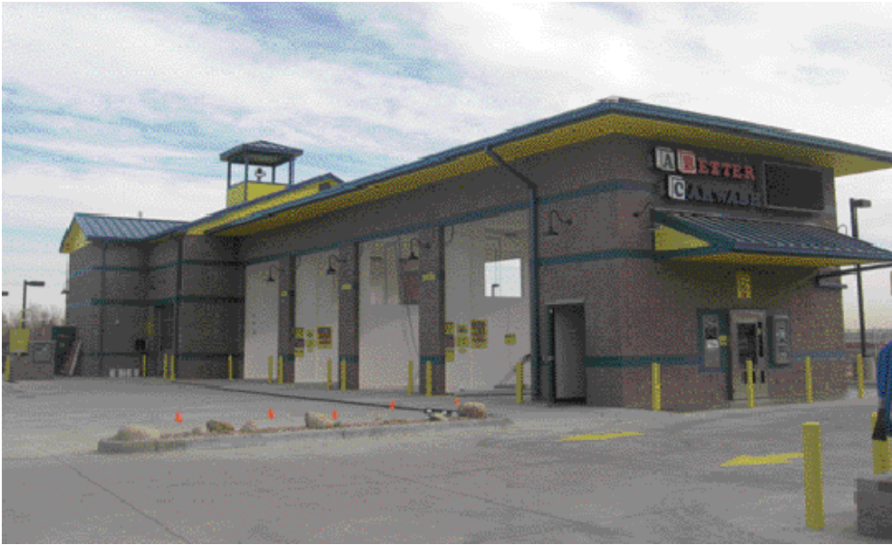
ABC Carwash vending room and signage located at the end of the self-serve bays.

problem in the self-serve bays, we installed a trench drain that runs the entire length outside of all four self-serve bays to prevent any water from exiting those bays into the drive lane. The trench drains are located within the heated slab so the water will not freeze and cease to flow.