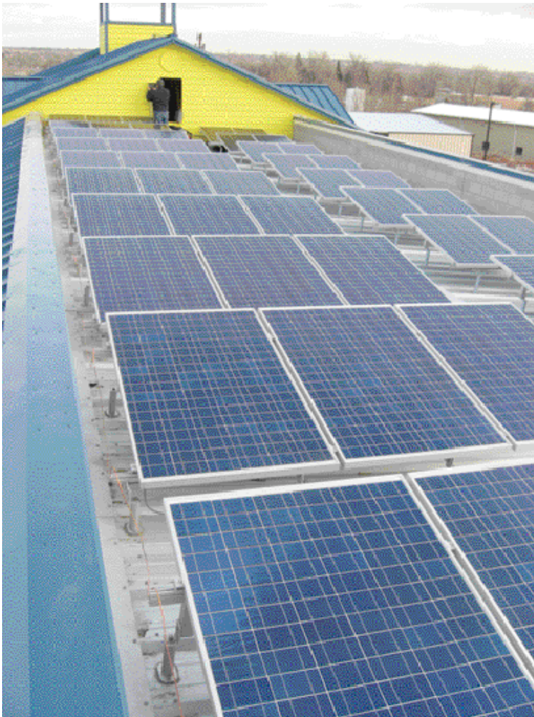
The solar panel array is oriented due south with a 10-degree tilt and will produce approximately 12,325 kW-hrs of AC power per year, approximately 10 percent of ABC's electrical usage.

the challenge of building another wash but it had to be better than the first! The next ABC wash would be “Green”! As Beetham has rightly stated, “To succeed in any competitive environment, a business must be ... simply better.”