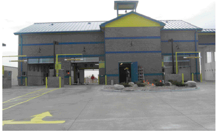
In order to accommodate photovoltaic solar panels, a flat roof replaced the original design of a truss roof system over the self-serve bays.